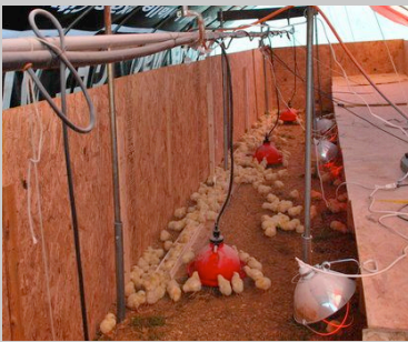
2600 chicks growing big enough to head out to pasture