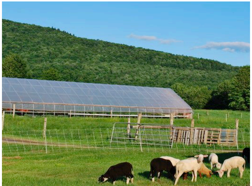
Lambs in the pasture

Add to linguini (or any favorite pasta) and top with parmesan cheese and olive oil, (add any other ingredients – chicken, tofu, shrimp). Serve warm or as a cold pasta salad (perhaps with bowties or another smaller pasta) over romaine lettuce with balsamic vinaigrette and olive oil.