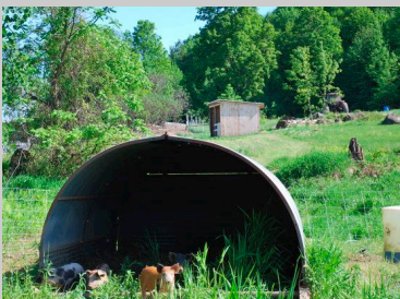
Piglets seeking shade